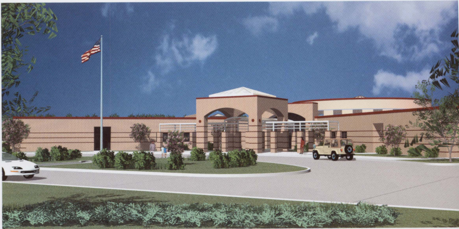
DISD will build a new elementary school within the master-planned community of Bay Colony. (Artist's Rendering.)

In addition to a solid infrastructure, the district features a strong, diversified curriculum, a relatively small enrollment of about 6,000 and an excellent student-to-teacher ratio of 16 to 1. The per pupil expenditure of $4,355 is substantially above the state average. In addition, the district attracts outstanding teachers with salaries averaging $29,264. Nearly 45% of the district's teachers and administrators hold Masters degrees or higher and at least half have been with the district for 10 years or longer.